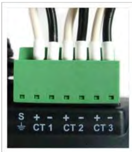
Photo 3: Connect White Wire to Positive Terminal. Connect Black Wire to Negative Terminal.

ALL WORK SHOULD BE PERFORMED BY A QUALIFIED ELECTRICIAN USING PROPER SAFETY EQUIPMENT