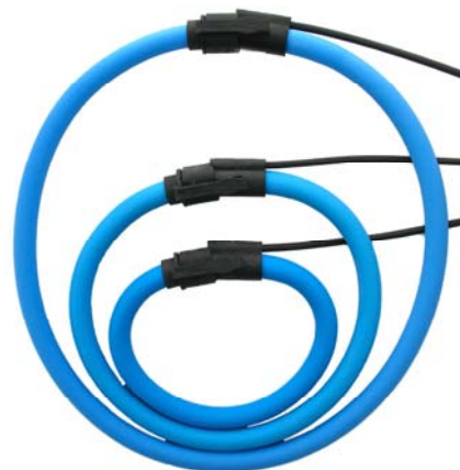
DENT's RoCoil Current Transformers. 16", 24", and 36" lengths pictured.

Current Transformer accuracy is usually calibrated with the conductor centered in the CT window. In practice, the CT hangs on the conductor, as shown in figures 1 and 2, which can introduce measurement errors. Note that the error is greatest when the CT connector hangs on the conductor.