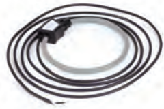
E683x Series Rope CT (sold separately)

The E5xxxA Series DIN Rail Meter combines exceptional metering performance with a built-in integrator and power supply to deliver a cost-effective, easily installed solution for power monitoring applications. Multiple communication protocol options offer added flexibility for easy system integration.