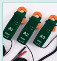
Model PQ34-2 200A Current Clamp Probes with 0.8" (19mm) jaw size

Choose the best clamp probes to fit your application needs ranging from 200A to 3000A and flexible vs traditional jaw type.