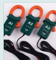
Model PQ34-12 1200A Current Clamp Probes with 2" (50mm) jaw size